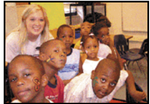
Fun Day: Face Painting

The kids' enthusiasm for our Camp Mikell week is unending and who can blame them? The Camp Mikell staff and counselors love the week as much as the kids do. And we get to sing and eat and play and dance and sleep ( this is overrated for the campers but not the adults! ) and most of all we get to swim every day! The Camp Mikell experience is like no other!